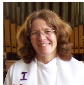
Organist/Director Raleigh Court United Methodist Church Roanoke, VA

STARLING AVENUE BAPTIST CHURCH 923 STARLING AVENUE, MARTINSVILLE, VA 24112