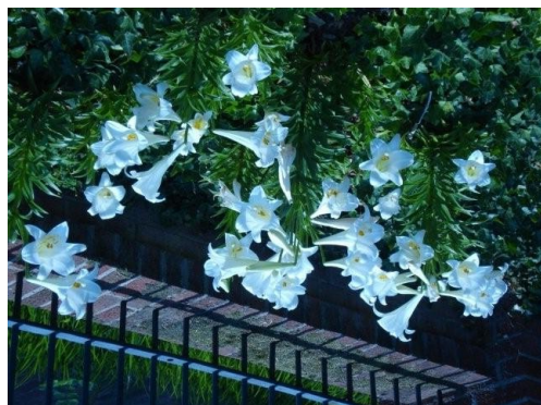
Beautiful Easter lilies in the courtyard.

Broad Street Christian Church 106 Broad Street Martinsville VA 24112