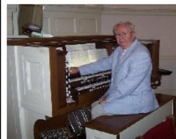
Organist Pocahontas Bassett Baptist Church Bassett, VA

POCAHONTAS BASSETT BAPTIST CHURCH 120 OLD BASSETT HEIGHTS ROAD, BASSETT, VA 24055