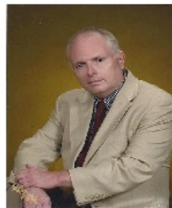
Organist First Baptist Church Martinsville, VA

FOREST HILLS PRESBYTERIAN CHURCH 725 BEECHNUT LANE, MARTISVILLE, VA 24112