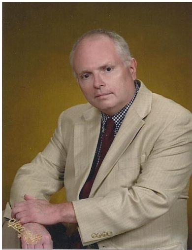
Organist First Baptist Church Martinsville, VA

FOREST HILLS PRESBYTERIAN CHURCH 725 BEECHNUT LANE, MARTISVILLE, VA 24112