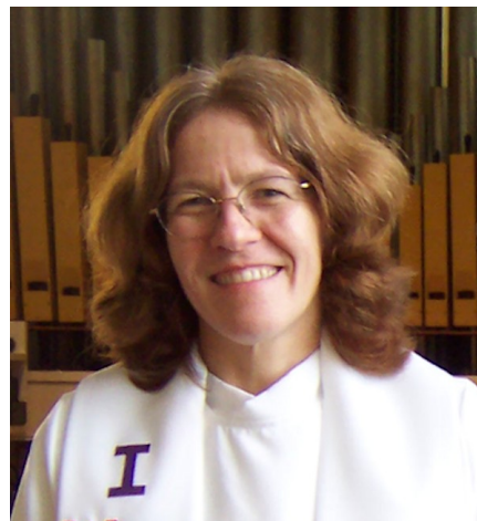
Director of Music Ministries Raleigh Court United Methodist Church Roanoke, VA

STARLING AVENUE BAPTIST CHURCH 923 STARLING AVENUE, MARTINSVILLE, VA 24112